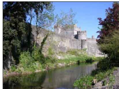
Cahir castle, Co. Tipperary