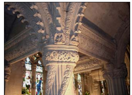
Medieval stone carving, Roslin Chapel