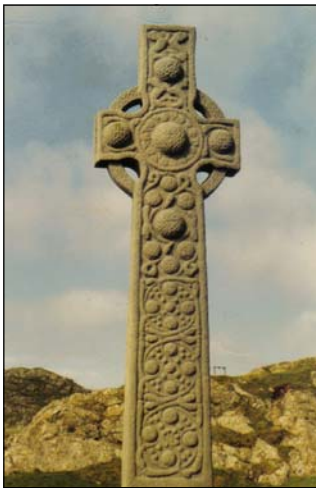
St Martin's Cross, Iona

Take a journey through the Celtic Lands to experience the sacred landscape and culture that has inspired beautiful art forms in stone and books for thousands of years and thrives today in lively contemporary art and music.