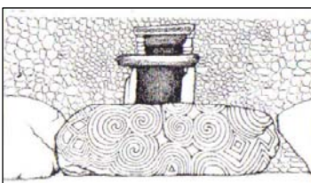
Stone spiral carvings at Newgrange